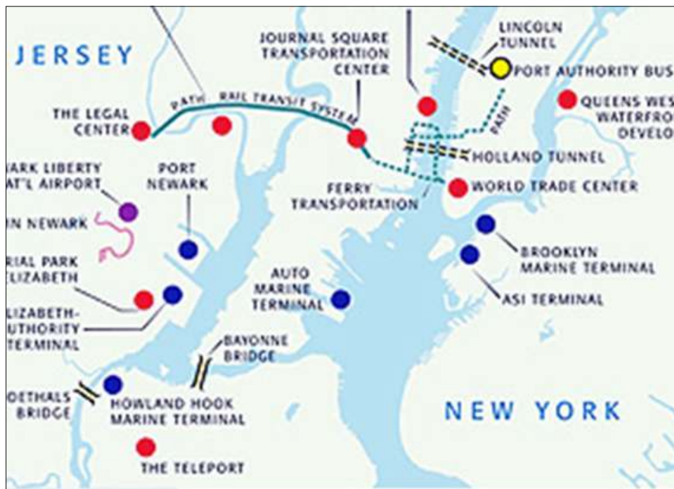
Figure 2. Port locations on New York and New Jersey

Note: Blue marks indicate the Port of New York and New Jersey